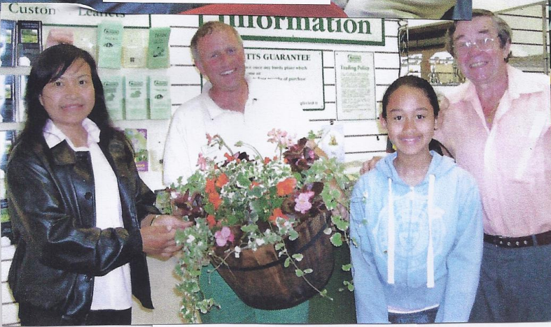
Guess who won the Raffle at Nottcuts!